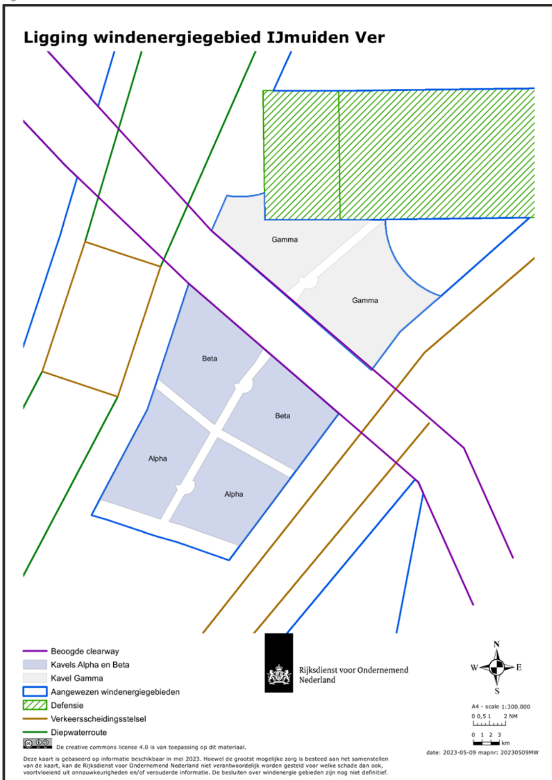
Figure S2 Location of IJmuiden Ver Wind Farm Zone and site subdivision